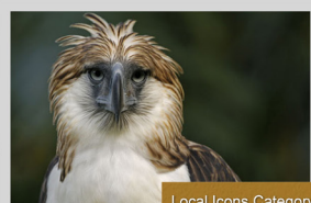
Local Icons Category